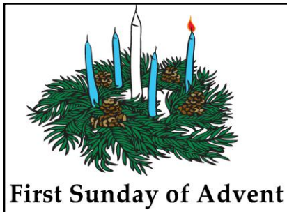
First Sunday of Advent

Advent — the first season of the liturgical year — includes the four Sundays and weeks prior to December 25. Advent dates from the fourth century, when it lasted 40 days and included fasting and solemnity, much like Lent.