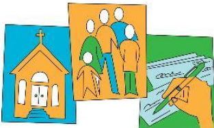
Attendance and Offering

Attendance last Sunday: 57 Offering last Sunday: $1,960.00 Total Deposit $2,014.00